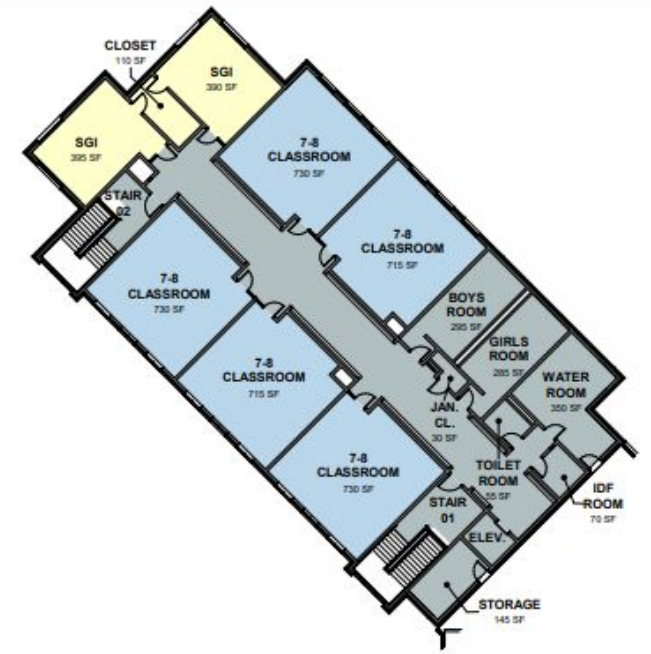
② SECOND FLOOR PRESENTATION PLAN SCALE: 1/16" = 1'-0"